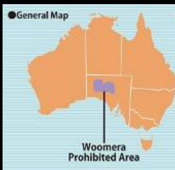
Map of Australia where Hayabusa landed