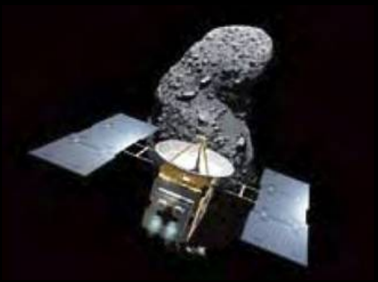
Hayabusa and asteroid Itokawa (concept drawing)

As most of you are aware we are from Adelaide in South Australia and recently our State was involved in some new Space history. On the 13th June 2010 the Japanese space capsule Hayabusa returned to earth and landed at the Woomera testing range at 11.21pm local time. The Japanese Aerospace Agency (JAXA) launched the capsule on the 9th May in 2003 and it has clocked 2 billion kilometers in its travels. The aim of the mission was to meet up with the asteroid Itokawa and although the second craft to have landed on an asteroid it is the first one to return home with a sample. It landed on the asteroid in 2005 and started its journey home in 2007 and finally landed in June. To check out more information see http://www.isas.jaxa.jp/e/enterp/missions/hayabusa/index.shtml