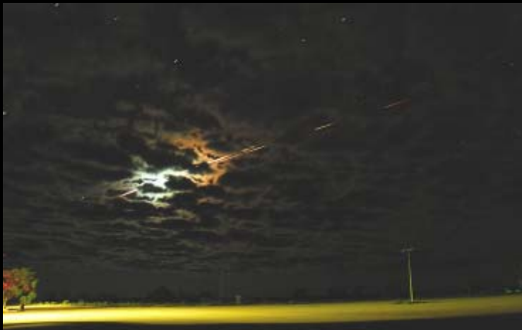
Hayabusa re-entry to earth in Australia from the ground