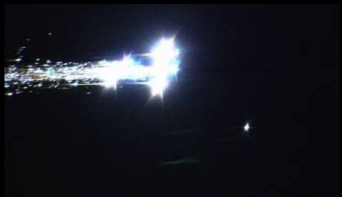
Hayabusa re-entry to earth in Australia from the air