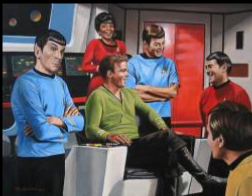
Original Artwork by TrekkieKim