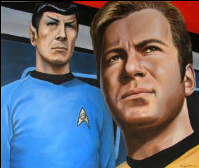
Original Artwork by TrekkieKim

Growing up as an only child on a cattle ranch in Montana, her earliest art was primarily expressed in pencil drawings of horses, cowboys and Indians... usually on whatever scraps of blank paper she could find.