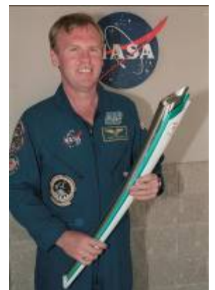
Australia's own Astronaut Andy Thomas