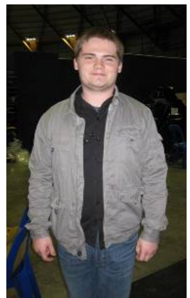
Jake Lloyd at Supanova Sydney