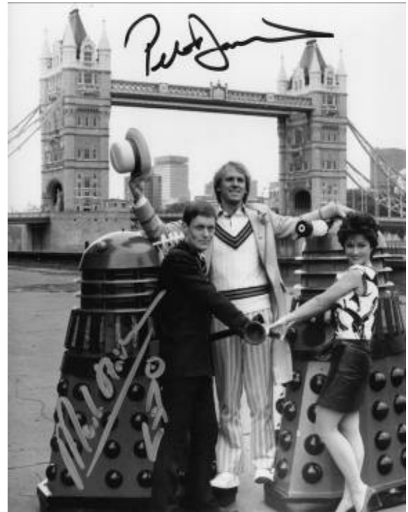
Competition prize see issue 13