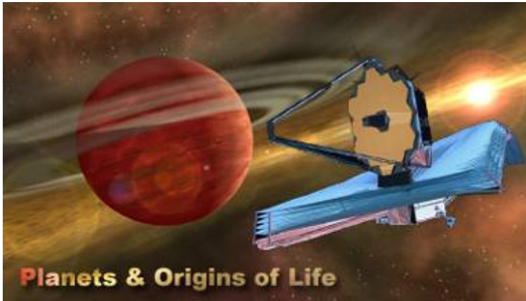
Artist's Conception of a Planetary Disk (credit: NASA/JPL-Caltech/R. Hurt (SSC))

In 2014 the James Webb Telescope will be launched taking over from The Hubble Telescope. Its new design will allow the detection of infrared radiation. This means it will be able to view objects that are far beyond the reach of the Hubble and help to reveal the answers to some of the biggest mysteries of astronomy.