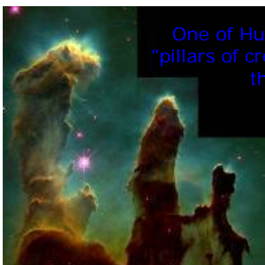
One of Hubble's most famous images, "pillars of creation" shows stars forming in the Eagle Nebula