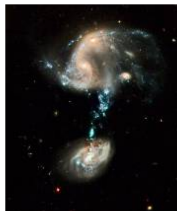
Interacting Galaxies Group Arp 194