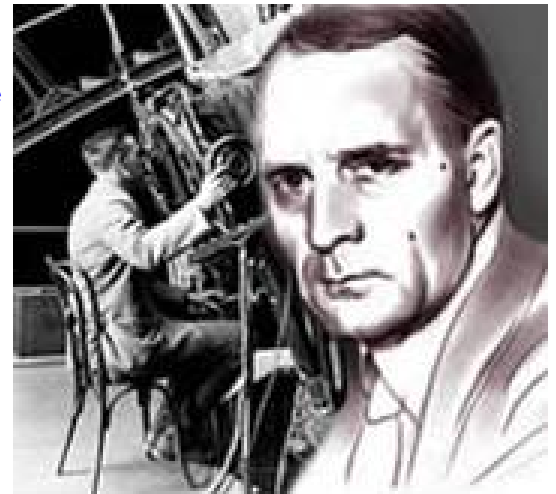
Edwin Hubble

Hubble's position outside the Earth's atmosphere allows it to take extremely sharp images with almost no background light. Hundreds of thousands of images have been sent back to Earth to help shed light on some of the great mysteries of astronomy.