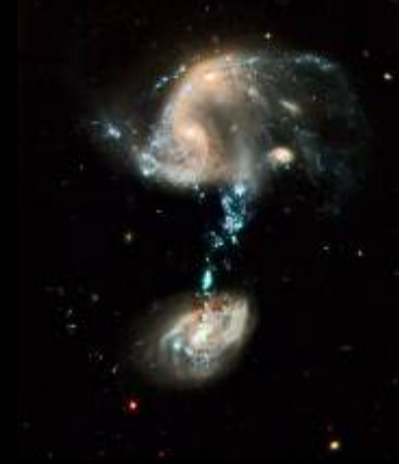
Interacting Galaxies Group Arp 194