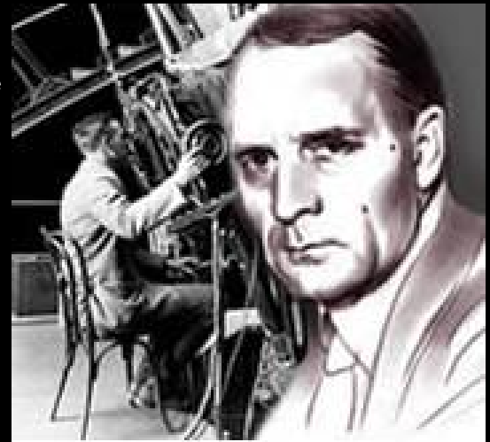
Edwin Hubble Credit: The Huntington Library, San Marino, CA, and artist Kathy Cordes, STScI

Hubble's position outside the Earth's atmosphere allows it to take extremely sharp images with almost no background light. Hundreds of thousands of images have been sent back to Earth to help shed light on some of the great mysteries of astronomy.