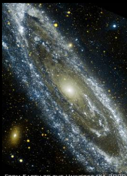
FROM EARTH TO THE UNIVERSE IYA 2009

Facilitate the preservation and protection of the world's cultural and natural heritage of dark skies in places such as urban oases, national parks and astronomical sites.