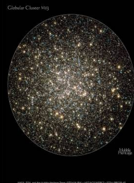
Global Cluster M13