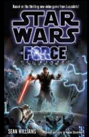
Sean's latest "The Force Unleashed"

Check out Sean's site at http://www.seanwilliams.com/ or click on the pictures below