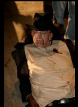
Chewbacca Peter Mayhew

Certainly a movie that makes you think!! It is intelligent and intriguing cinema, with a touch of sultry sexiness. Oh and if you look quickly you may see Chewbacca (Peter Mayhew) who plays the role of the "dead man"!