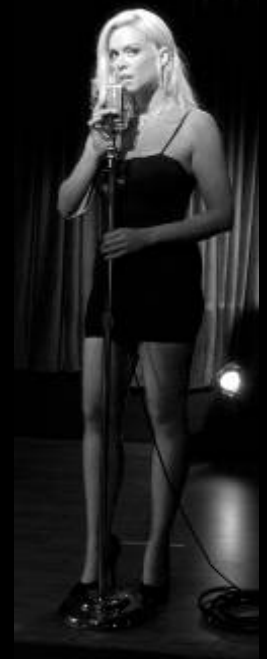
Chase looking sultry

It is interesting to see that the main character is a women detective in what at times looks like it is set in the 1930s or is it the 2000s, dial phones (what are they!!) versus e-mails. The film makes you concentrate and you have to stay with it to make sure that you do not miss a sudden change of direction. In fact, this movie is better watched with your friends who like to discuss plot, character interplay and in fact, all aspects of life, the universe and everything.